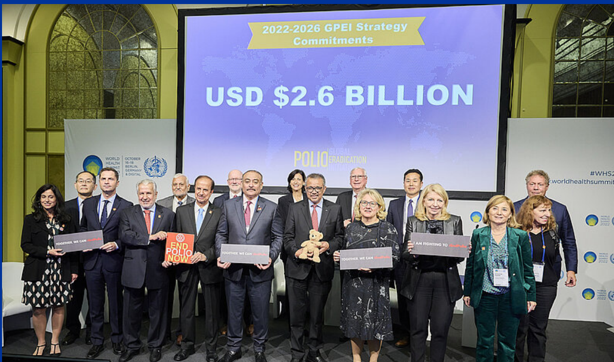
Global leaders commit US$ 2.6 billion at World Health Summit to end polio.