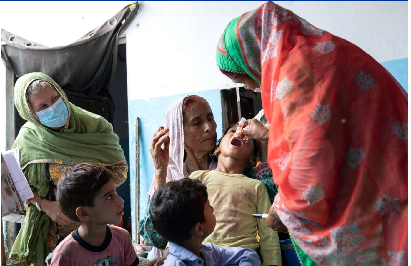
Jennifer Jones, President of Rotary International (in green), shadows female health workers as they carry out polio immunization activities in Pakistan.