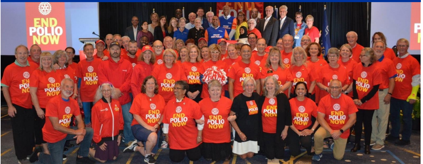
Partners celebrate the Government of Canada's new pledge to the GPEI of Can$ 151 million.