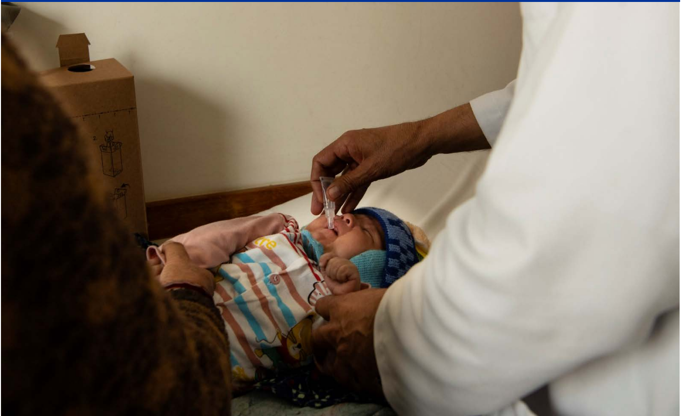
A child receives polio vaccine at Bamyan Provincial Hospital.