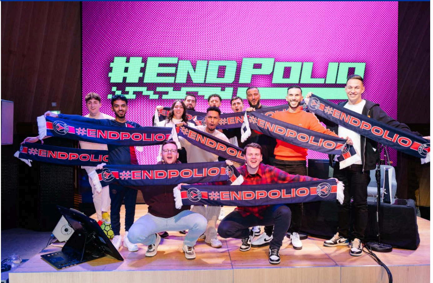
The French gaming community comes together to defeat a common enemy – polio. @GPEI