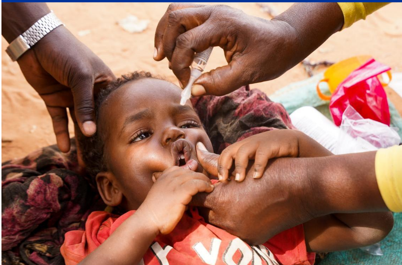
A child in Sudan gets vaccinated against polio.