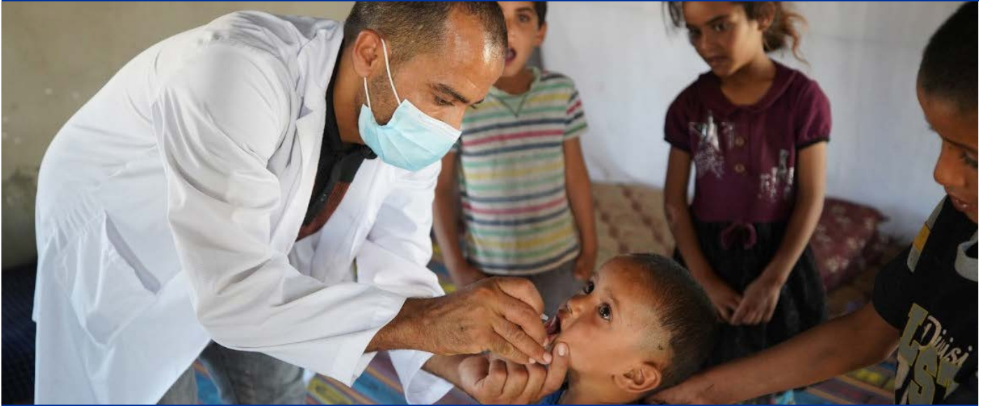
A child is vaccinated against polio.