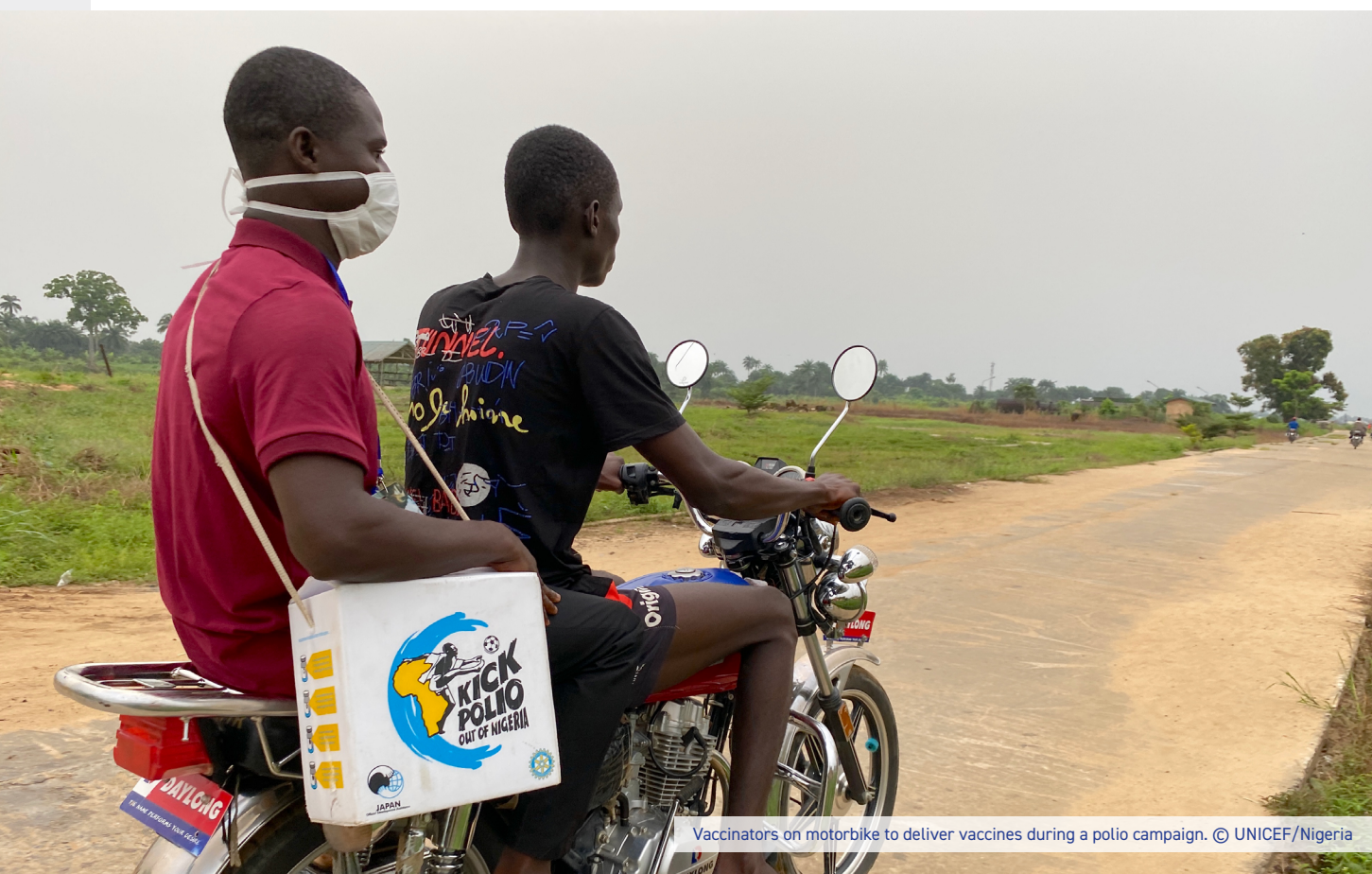
Vaccinators on motorbike to deliver vaccines during a polio campaign.