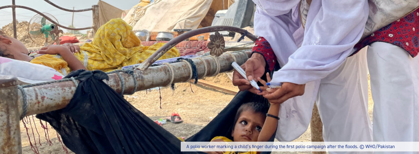
A polio worker marking a child's finger during the first polio campaign after the floods.