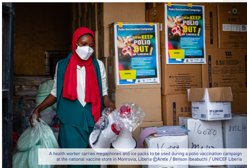
A health worker carries megaphones and ice packs to be used during a polio vaccination campaign at the national vaccine store in Monrovia, Liberia