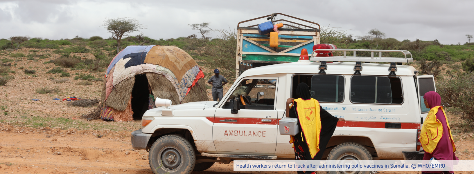
Health workers return to truck after administering polio vaccines in Somalia.