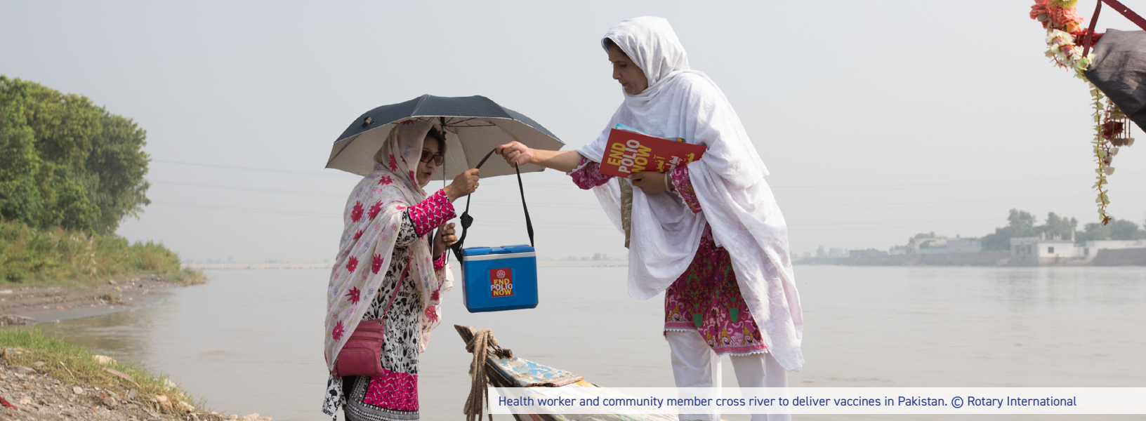
Health worker and community member cross river to deliver vaccines in Pakistan.