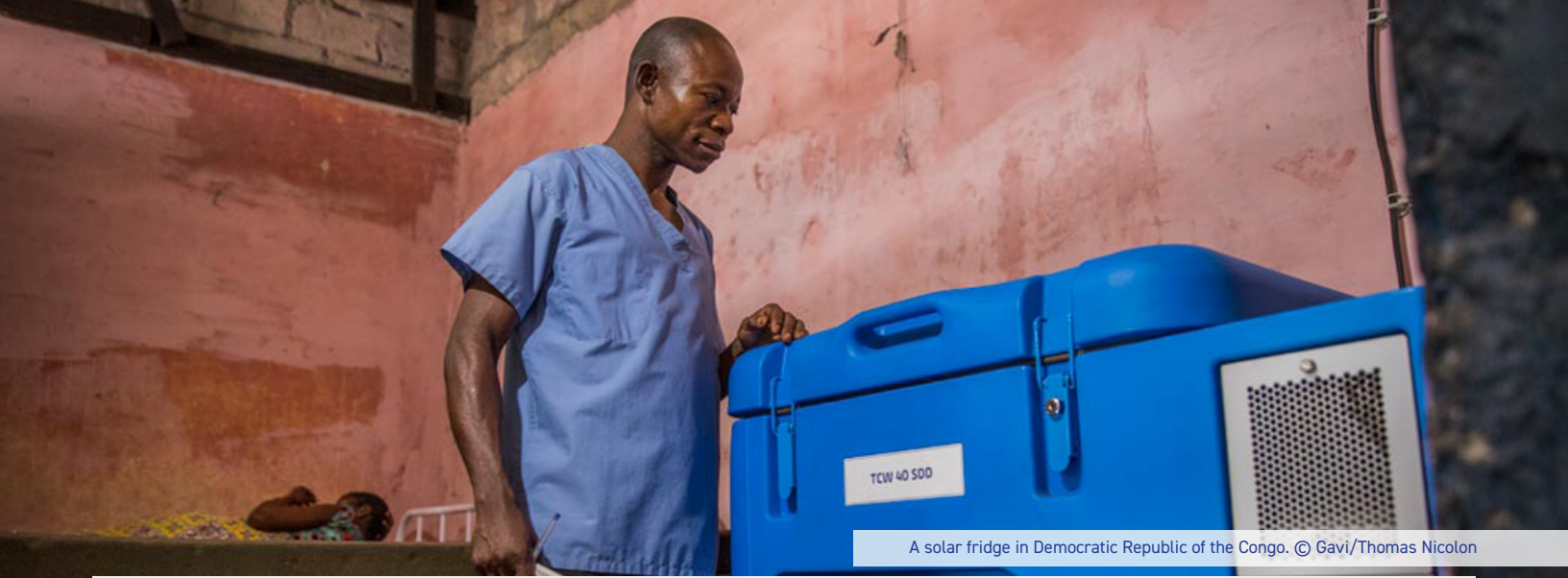
A solar fridge in Democratic Republic of the Congo.