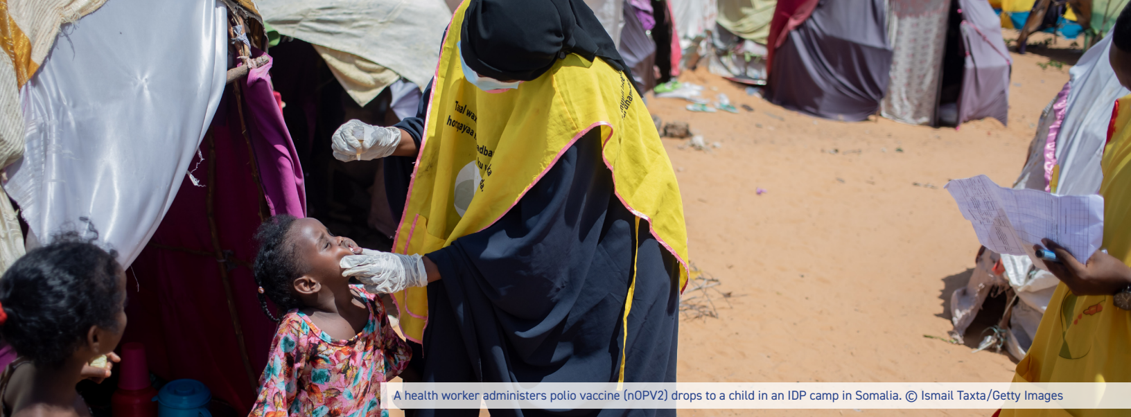
A health worker administers polio vaccine (nOPV2) drops to a child in an IDP camp in Somalia.