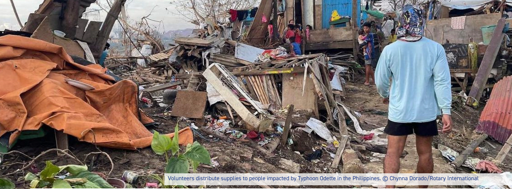
Volunteers distribute supplies to people impacted by Typhoon Odette in the Philippines.