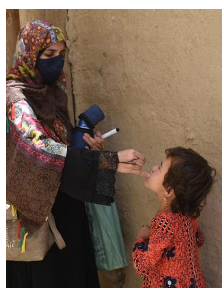
A health worker delivers polio vaccines in Pakistan.

Pakistan is on a mission to end polio, but a sudden surge in cases has alarmed those fighting eradication. In collaboration with Rotary, Pakistan's polio programme is working closely with the national government to better reach high-risk populations and build community trust to improve vaccine acceptance. The key to eradication? Keeping vaccination coverage rates high amid flooding and other persistent challenges. [More]