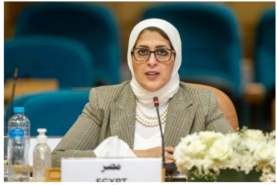
Dr Hala Zayed

were ioined by the members of GPEI's Polio Oversiaht Board (POB) to discuss ongoing and future activities to stop and prevent the spread of wild polio and cVDPV outbreaks. [More]