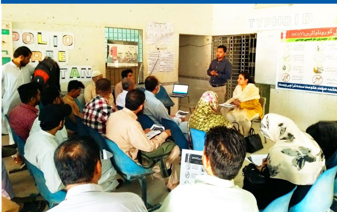
Polio staff conduct COVID-19 awareness training in Gadap, Pakistan.