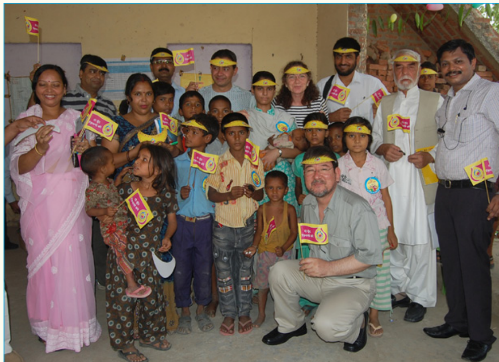
Afghanistan team with polio partners and children in Moradabad, Uttar Pradesh.