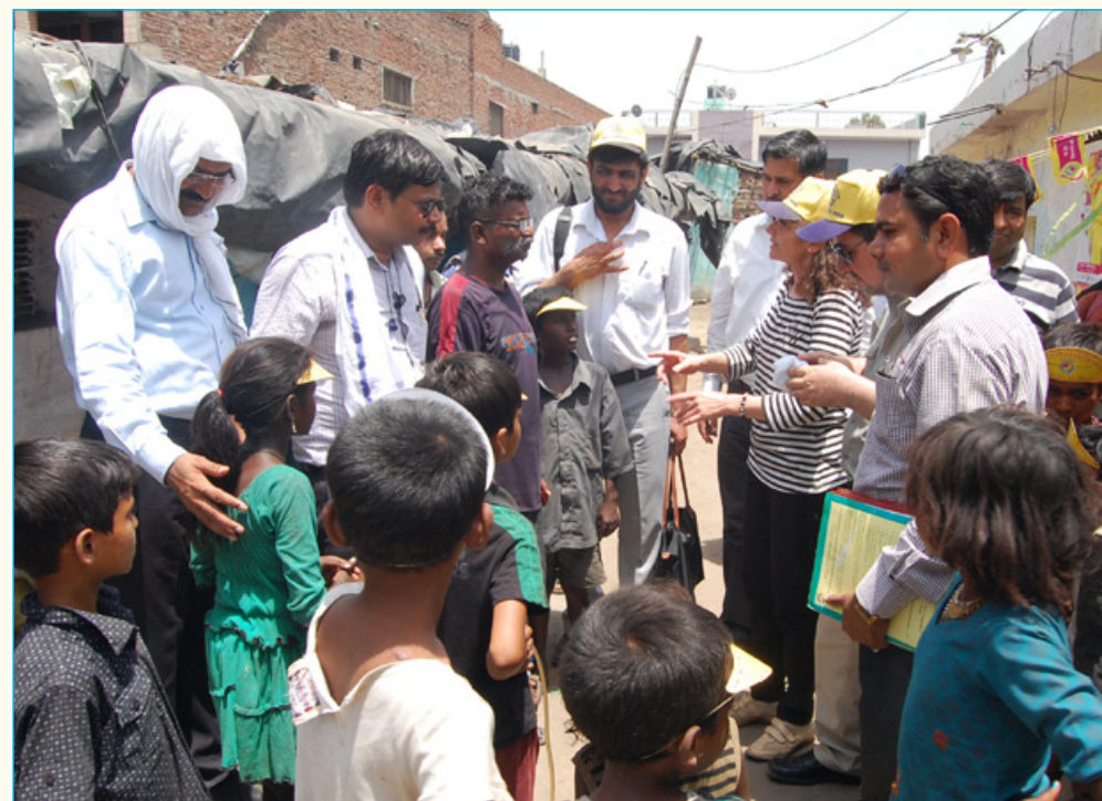
Afghanistan team interacting with the community during their field visit in Moradabad, Uttar Pradesh.

Clearly, this partnership between countries and sharing of expertise and know-how can go a long way to eradicating polio globally. ■