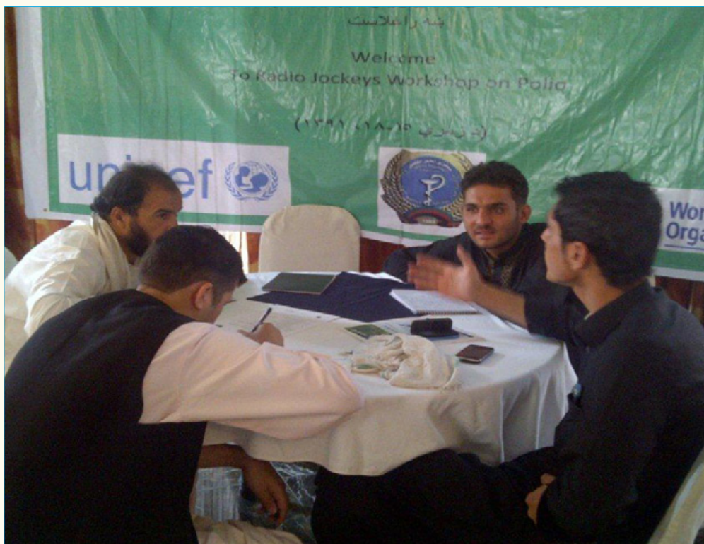
Radio jockeys at a media workshop on polio in Kabul, Afghanistan.

programmatic best practices, including: programme management, methods to maximize coverage during rounds, media advocacy strategies, monitoring and evaluation formats, communication and training materials, and ground-level tools to increase the effectiveness of front-line vaccinators and social mobilizers.