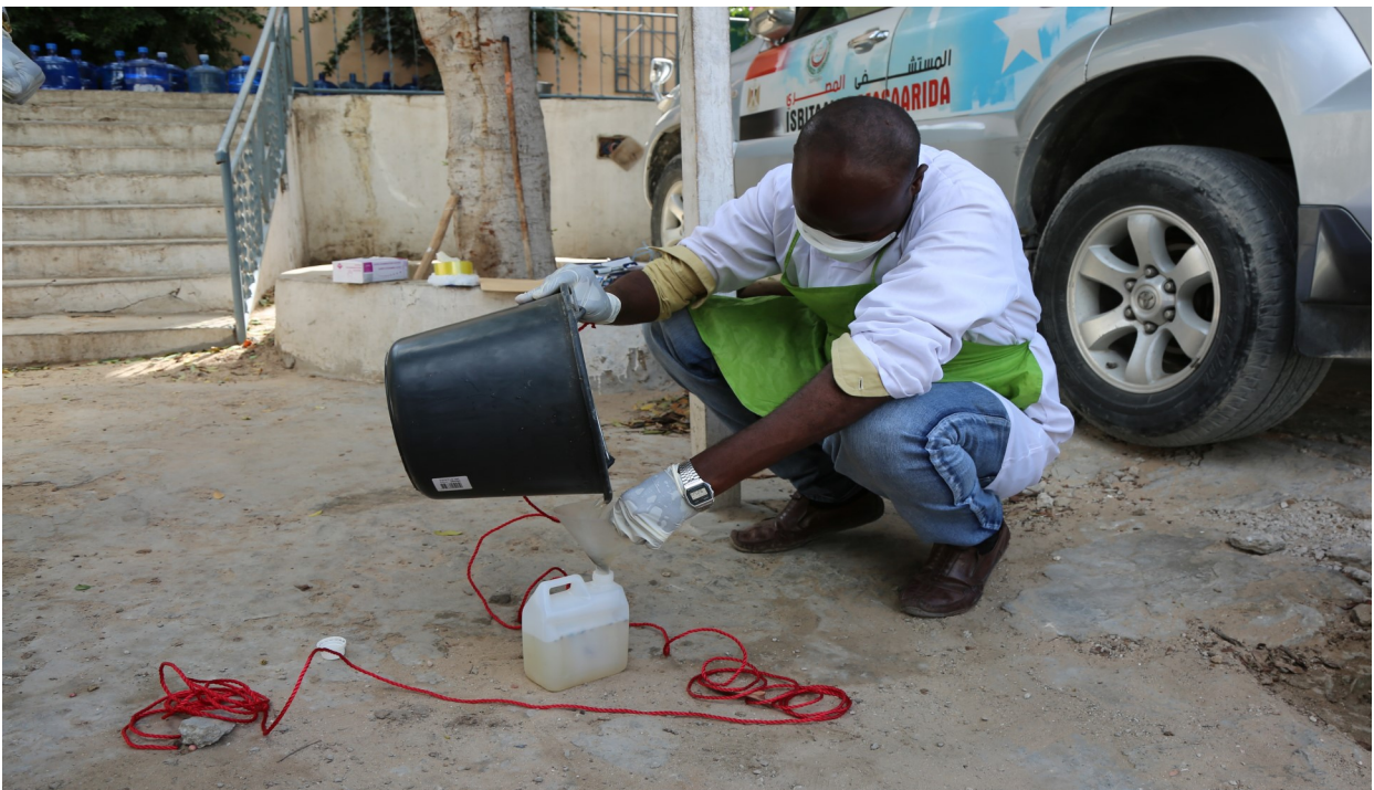
A sample is collected from an environmental surveillance site in Mogadishu.