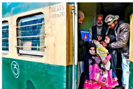
Vaccinating children at a railway station in Quetta.

The Technical Advisory Group on Poliomyelitis Eradication (TAG) convened this month to review Pakistan's progress against polio. The group focused on assessing specific initiatives, such as the use of new standards to rigorously measure a vaccination