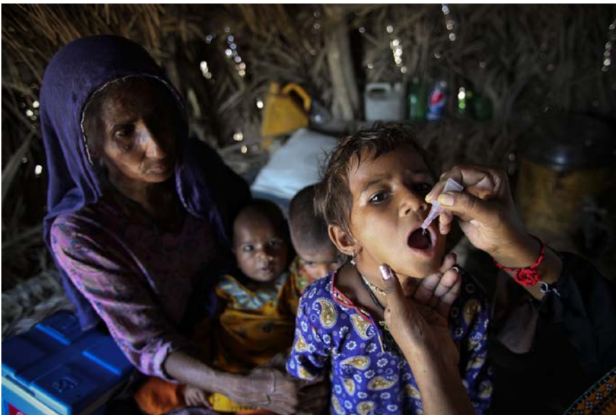
Children in Pakistan are reached with the crucial polio vaccine.