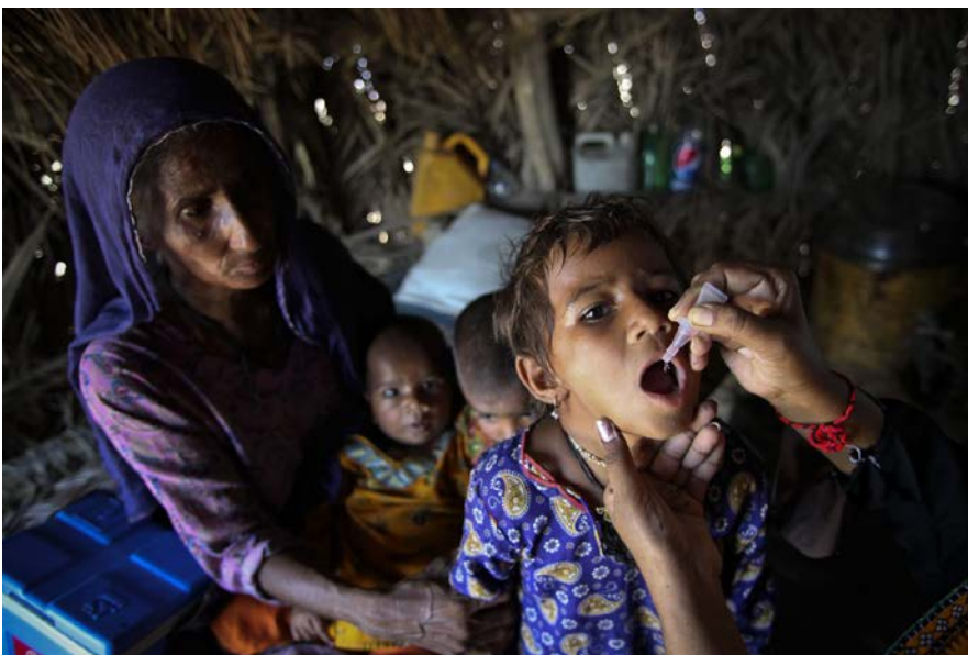
Children in Pakistan are reached with the crucial polio vaccine.